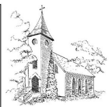
St. Mary of the Rosary, Hepworth Sunday 9:00 am (Nov-Mar)

Email: stmaryowensound@hamiltondiocese.com www.stmarysandthemissions.ca